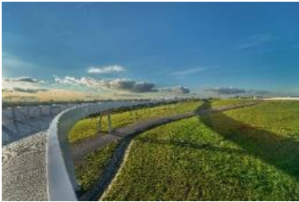
häfner jiménez betcke jarosch landschaftsarchitektur, Berlin Energy mountain, Georgswerder, Germany