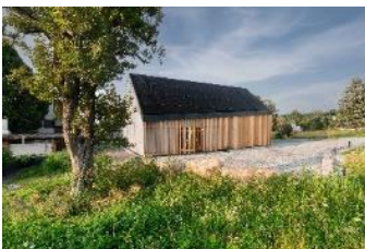
furoris X art, Chemnitz Cultural and information centre, Ursprung, Germany