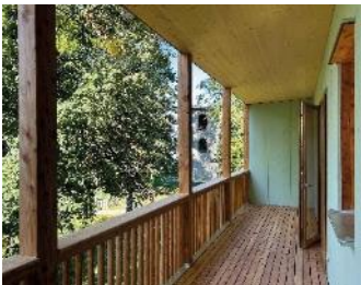
Florian Nagler Architekten, Munich Research House, Bad Aibling, Germany