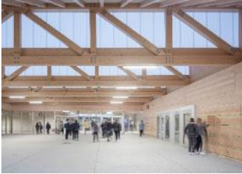
Dietrich Untertrifaller Architectes, Paris All-day school Bretenoux, Frankreich

Press images - free of charge for one-off, purely editorial use in the direct context and for the duration of the ARCHITECTURE AND ENERGY exhibition, provided the author is named.